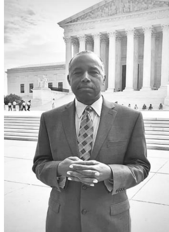
Dr. Ben Carson

The recent opinion out of the Supreme Court ruling affirmative action as unconstitutional is a massive win for achieving real equality in this country. Are we a perfect nation? No. But your skin color, sex, and religion do not determine your outcomes in life - hard work and determination do. We are not a nation of victims we are a nation of opportunity. This opinion ensures that everyone will have equal access to those opportunities.