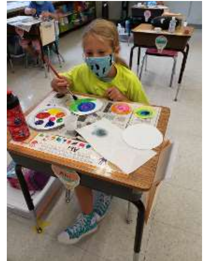
Trinity students wear masks at all times except during lunch, snack, nap time, recess and other outdoor activities.

One of the biggest struggles for teachers and students is the necessity of wearing masks. When rooms get hot, it can become hard to breathe. It's a big relief that when we go outside, where we're able to take off our masks. I know it's hard for everyone in the school, but hopefully, we will eventually get used to it.